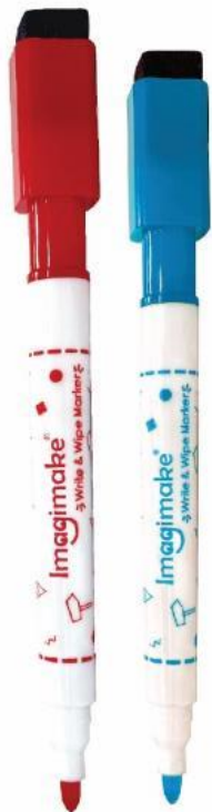
Write & Wipe Marker