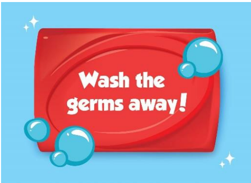
Soap Placard- Side 1