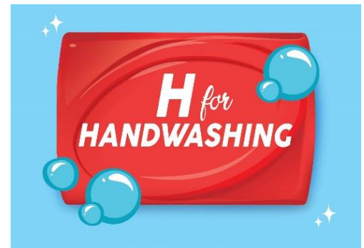
Soap Placard- Side 2